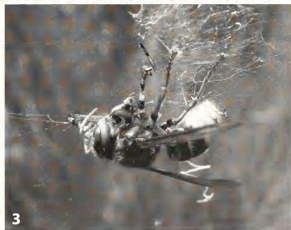
Figures 2, 3: Vespa crabro in web of Argiope bruennichi stealing the spiders prey (2), and with remnant of Argiope bruennichi (3).